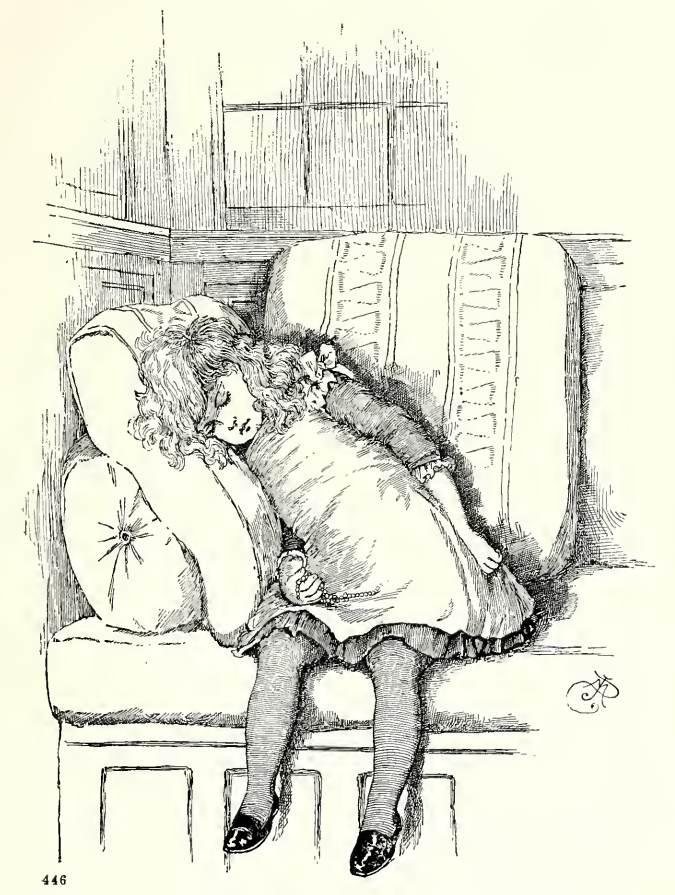
"Poor Button fell asleep."