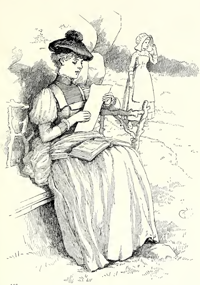
"She wrote it herself!"