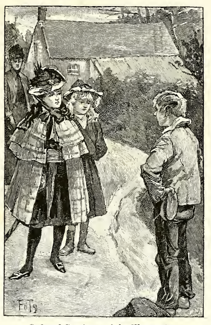
Reduced Specimen of the Illustrations.