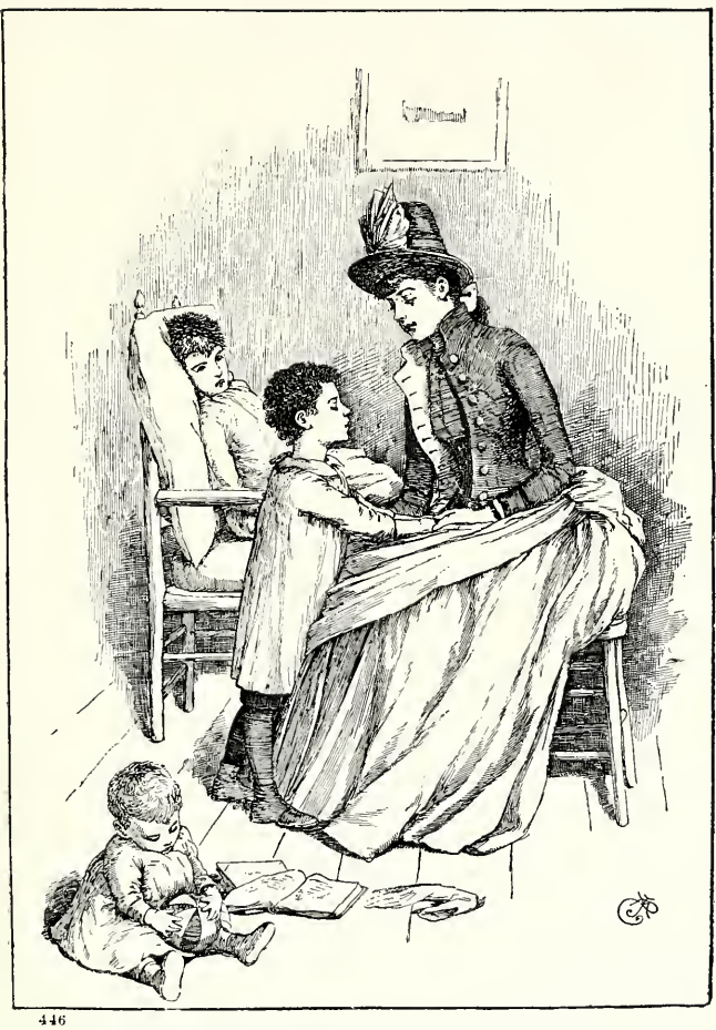
"The poor little thing came and stood at my knee."