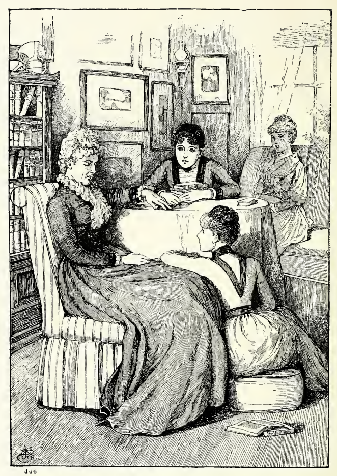
"Alice, with both elbows on the table, listened with wide-awake eyes."