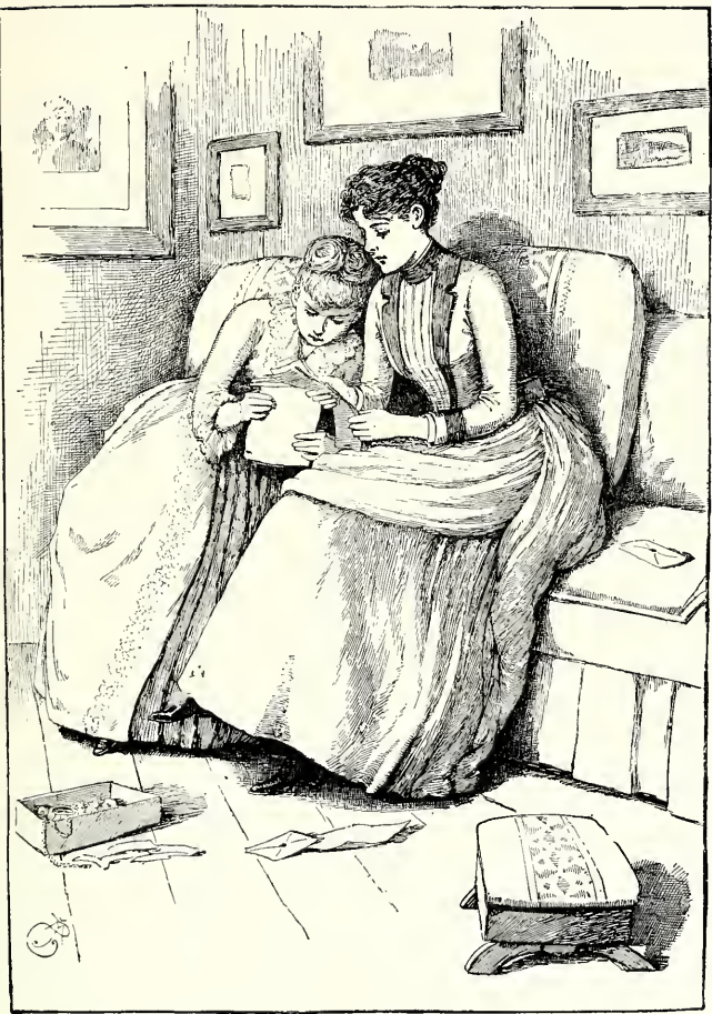
"And sitting side by side in an affectionate bunch, the girls read the happy news."